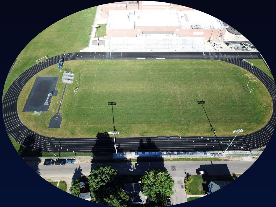
Global International Columbus Academy School (2 x 11v11 fields)