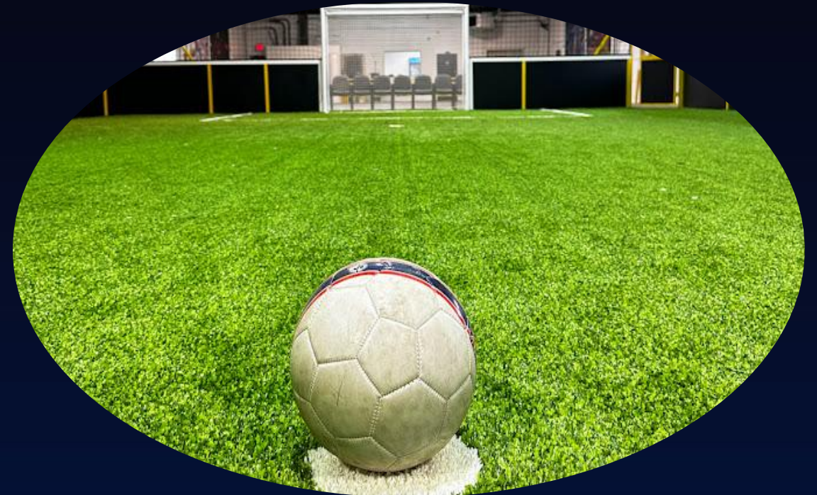
Soccer One Indoor Training (1x 7v7 and 2x 5v5)