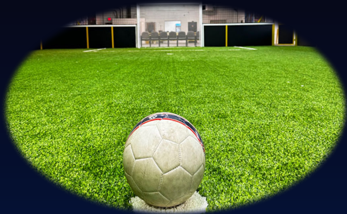
Soccer One Indoor Training (1x 7v7 and 2x 5v5)