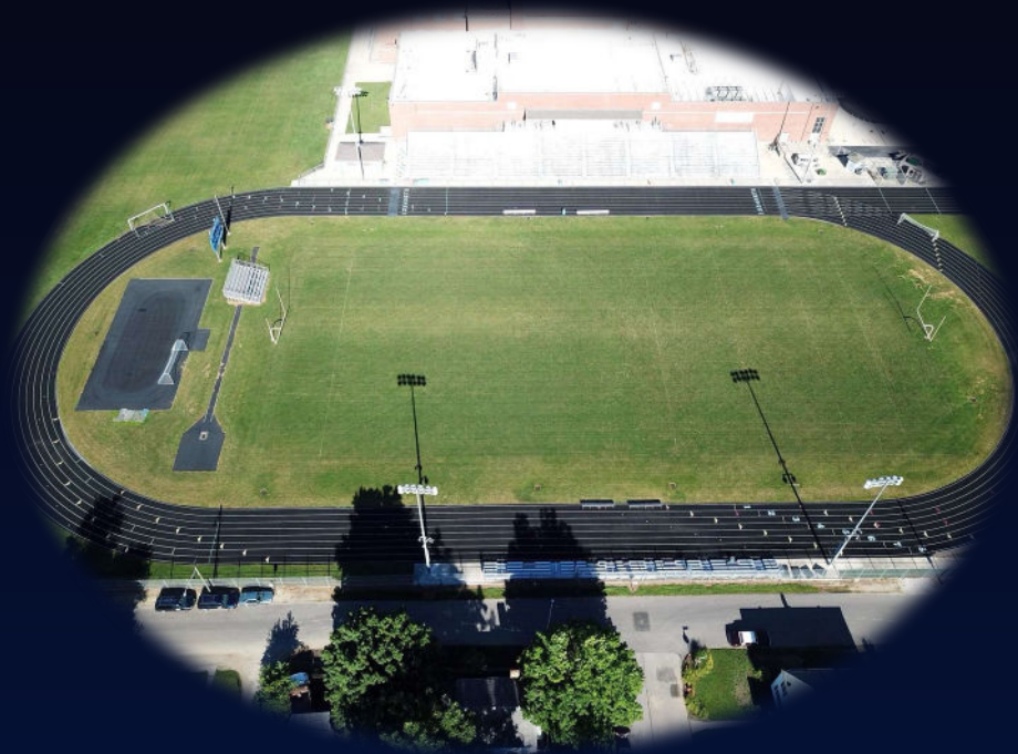
Global International Columbus Academy School (2 x 11v11 fields)